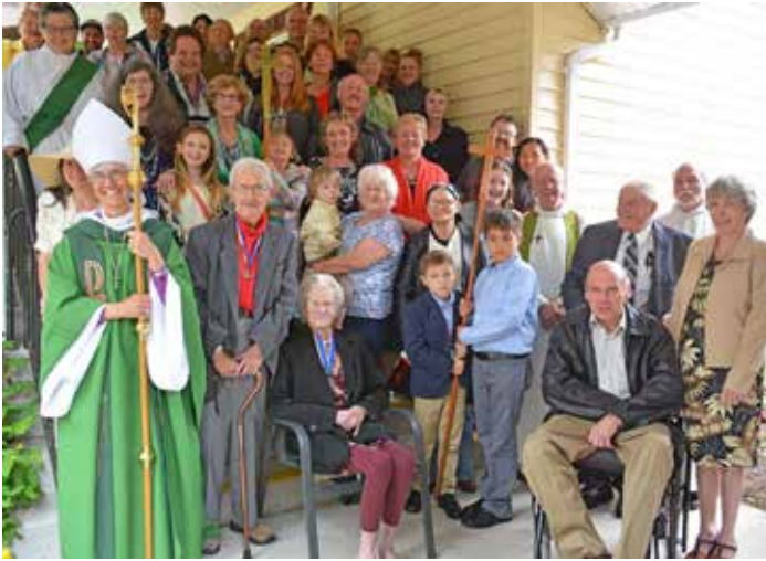
The Holy Spirit parish with the Bishop of New Westminster.