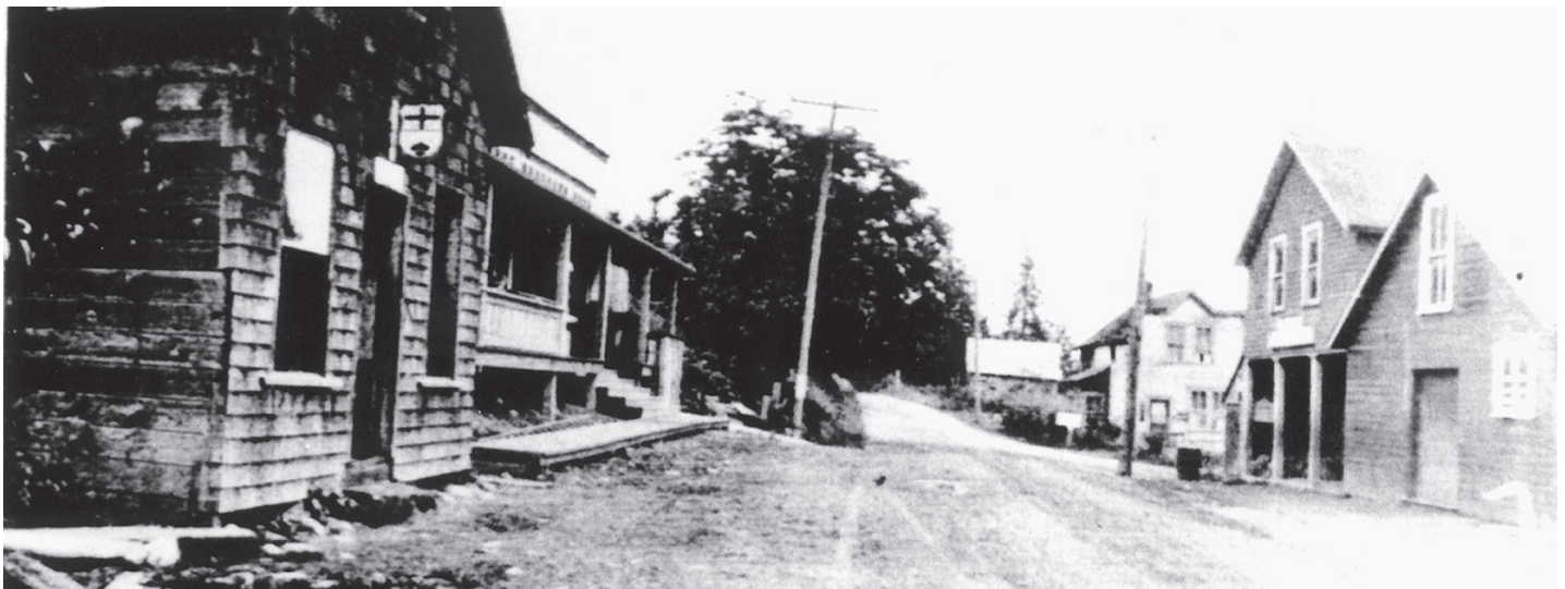
River Road at Whonnock looking east. On the left post office and Showler's, later Red & White store. Right Graham's store and at some distance Luno's. Note the dirt road! Picture was probably taken in the later 1920s.

After 130 years of continuous service to the community the Whonnock post office is still in operation and that is something we all should be very proud of. fb