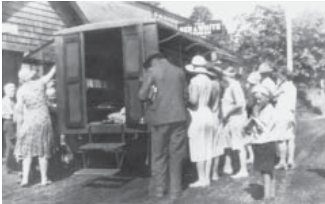
The library van in front of the post office in Whonnock in 1929, the year The Eternal Forest was published.