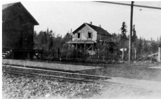
Ruskin store under construction, 1920. CPR freight shed on the left.